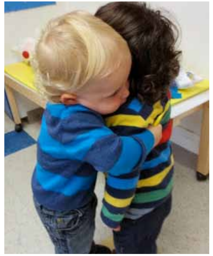
Holy Blossom Temple