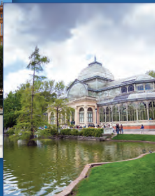
Retiro Park, Madrid