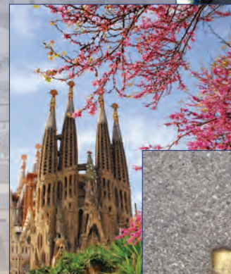
La Segrada Familia