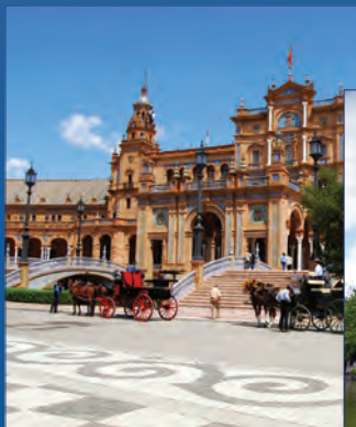
Plaza de España, Seville

For hotel and touring options, please see the CA 2016 PRICING CHART.