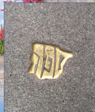
Sephard Heritage Marker

Jewish History in Spain is filled with contradictions. There is tragedy here, but there are also traces of former glories during the 1,000 years before the inquisition - these were large scale Jewish communities that prospered for long periods. We will delve into the past, as well as reach out to the nascent Jewish communities of today to hear their struggles, and their successes. With the Spanish government opening the door to citizenship for Jews with Spanish roots, and the opening of new centers of Jewish culture, there has never been a better time to visit Spain!