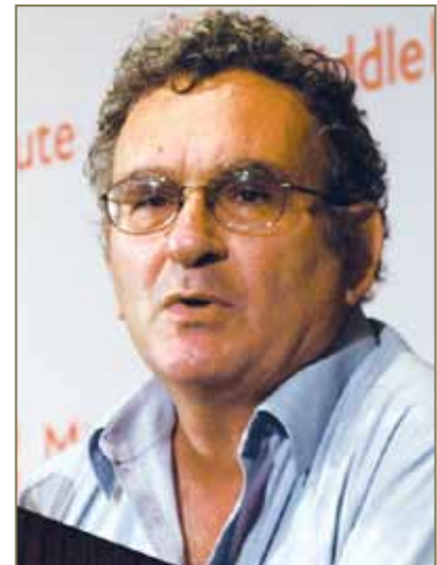
Benny Morris, Professor, Ben Gurion University, Beersheba, Israel