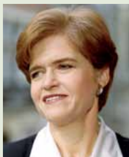
Deborah E. Lipstadt

Deborah E. Lipstadt will present the keynote Opening lecture, based on her recently published book of the same title. She will highlight the legal implications of the trial, the international reception of the trial in the 1960s, and discuss how the trial has become a media event.